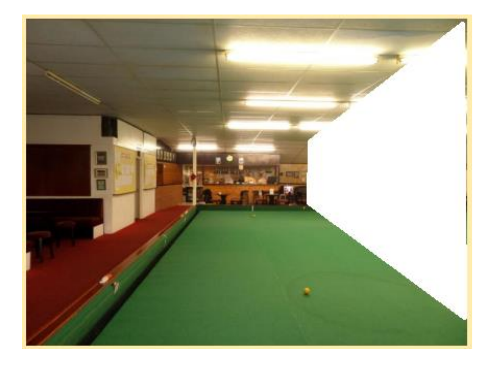
Seating Area, Kitchen and Bar