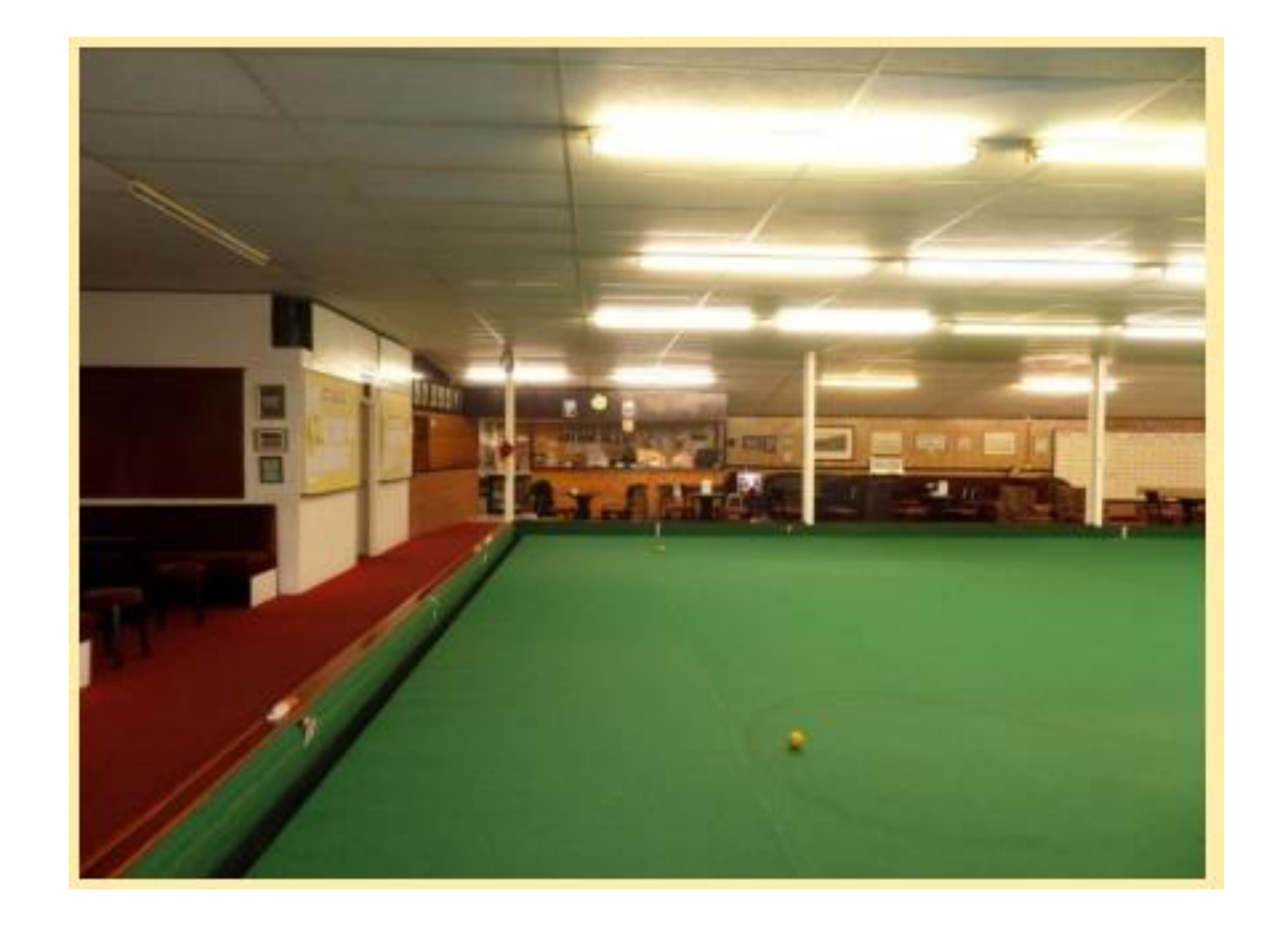
2 Rink Green, Kitchen and Bar